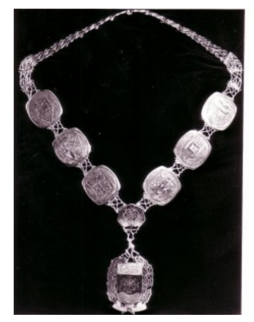
Chain of Office 1979 (University Archives)