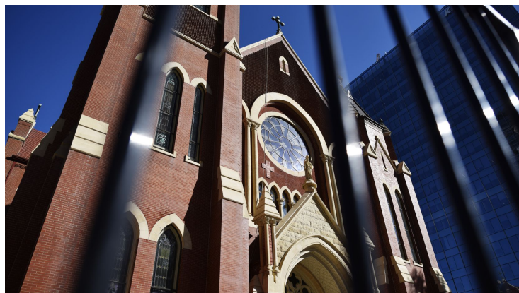
The Cathedral Shrine of the Virgin of Guadalupe shown behind a guard rail in downtown Dallas, Sunday May 19, 2019.