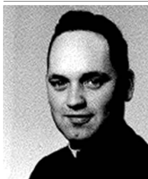
The Catholic Bulletin